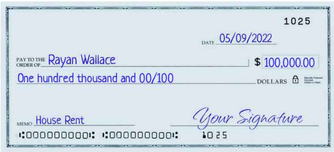
100000 dollars check

So, without further delay, let's learn how you can write 100000 dollars on a check in proper order, from top to bottom.