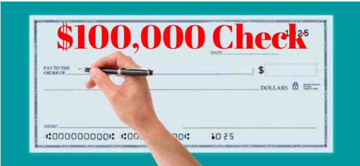
How to write a check