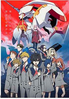
Darling in the Franxx