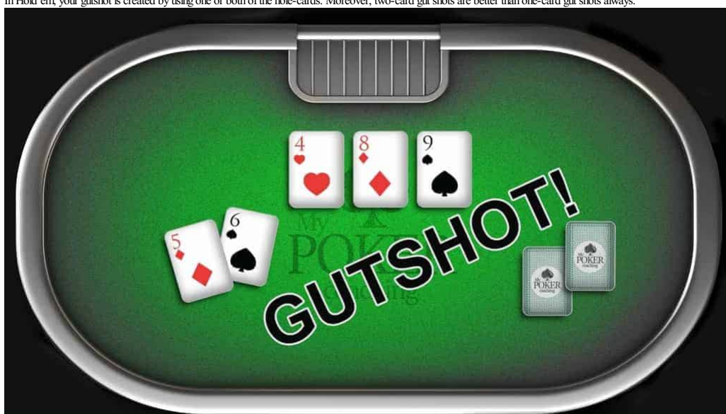
Gut Shot Strategy